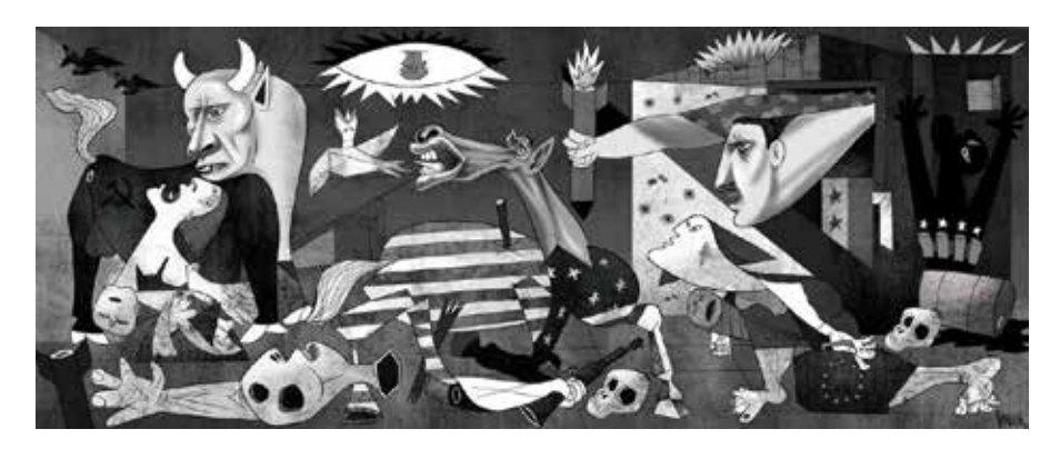
Caption Vasco Gargalo, "Alepponica"