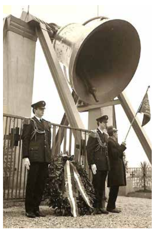
27 February, 1972: The Bell rings on the tenth anniversary after it was recast possible thanks to the support of the Lions Club of Italy