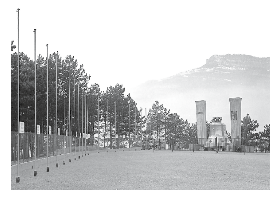
18 February, 1966: The new location of Maria Dolens after the transfer from Rovereto Castle to the Colle di Miravalle (Miravalle Hill)