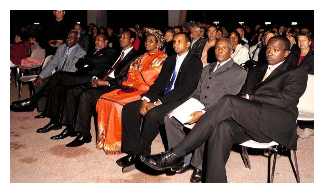
24 August 2005: "Dolomites of Peace" addresses the theme "Peace and Africa" in the presence of the Somali Prime Minister Ali Mohamed Ghedi