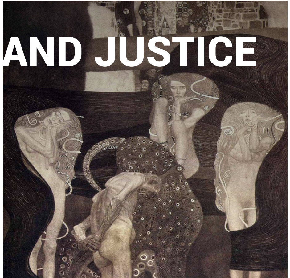
Gustav Klimt, "Jurisprudence" (Destroyed in the Immendorf Castle fire, 1903-1907)

For this reason, the seventh biennial report just released by the European Commission for the efficiency of justice by the Council of Europe (Cepej) is of particular importance. The data is relative to 2016 and for the first